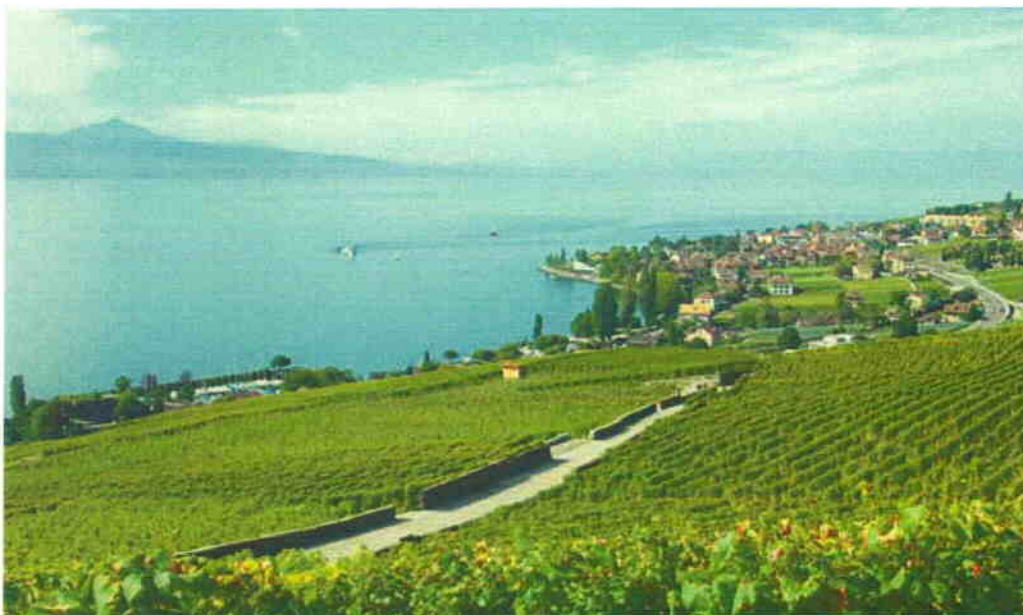
Cully